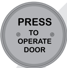
#59R4-P (Stainless Steel with Black Paint Filled Legend)