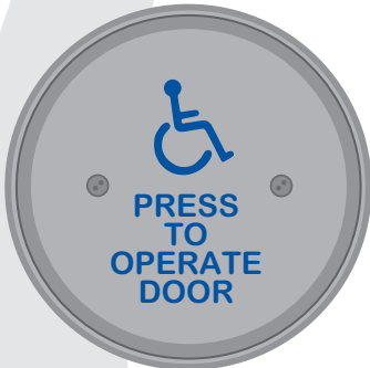
#59R6-HSS (Stainless Steel with Blue Paint Filled Legend)