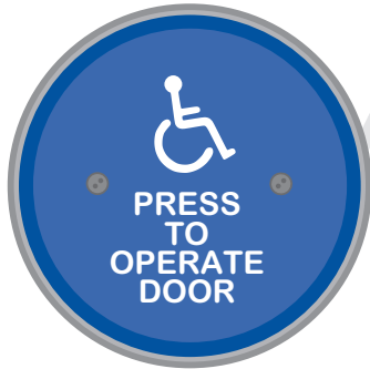
#59R6-H (Blue Powder Coat with White Paint Filled Legend)